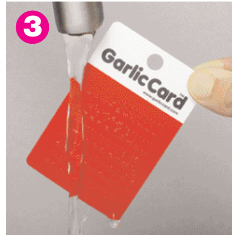
3 QUICK AND EASY TO CLEAN – RINSE WITH WARM WATER