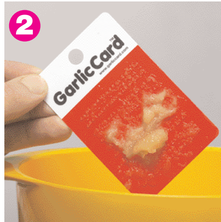
2 USE THE PURÉE TO SEASON ALL KINDS OF DISHES